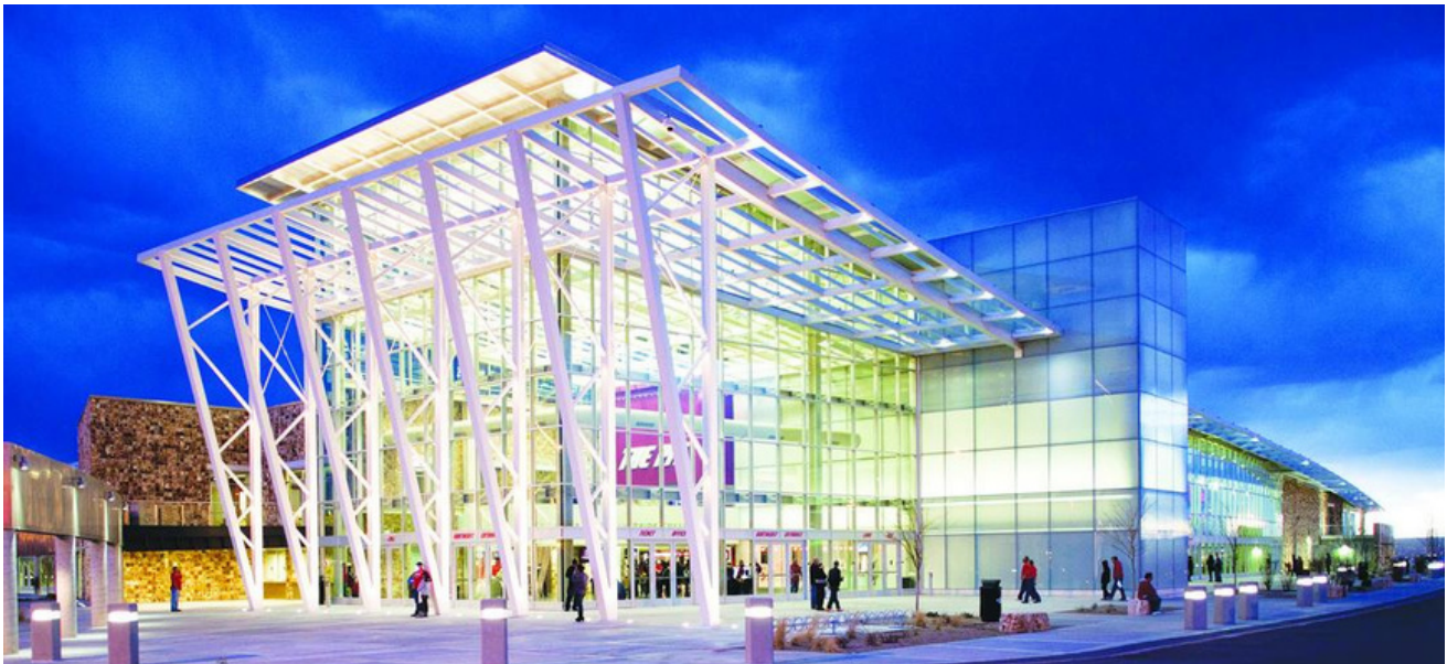
"The Pit" Stadium at the University of New Mexico located in ABQ.

Also located in Albuquerque is the University of New Mexico. This college is ranked #74 in the US with a 96% acceptance rate. The top majors at this school are Business Management, Marketing and Social Services.